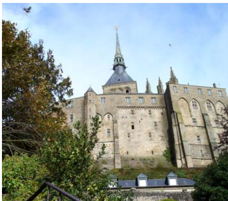
Archive photos. Indicative description non contractual.