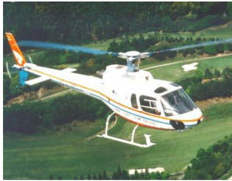
Archive photos. Indicative description non contractual.